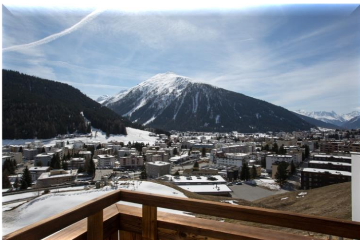
Your view over Davos

Price and conditions on serious request only