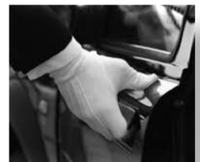
Chauffeurs with professional driver training