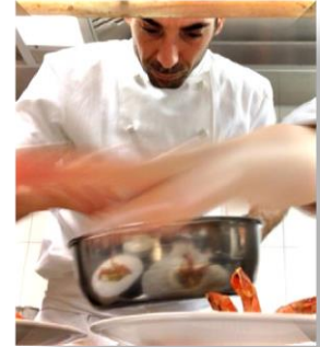
Chefs with Star Cook Status