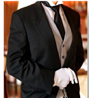
Private Butlers with five star Hotel training